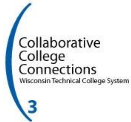
Fig. 2 Marketed Create Fest at C3 during OER Presentation